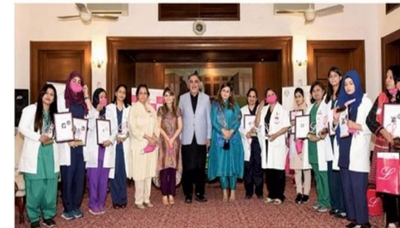
Governor lauds frontline workers role in checking pandemic

Held at Sindh Governor House, for Year 12, Governor Sindh presented awards to 12 female frontline workers who had risked their lives to save the lives of others during COVID-19.